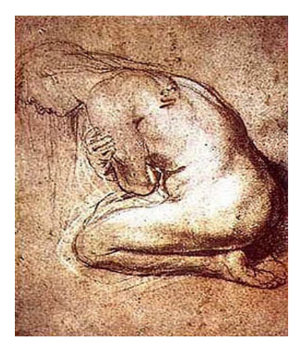
Figure 0.1: Pencil sketch of accused Heretic

The Malleus Maleficarum (The Witch Hammer), first published in 1486, is arguably